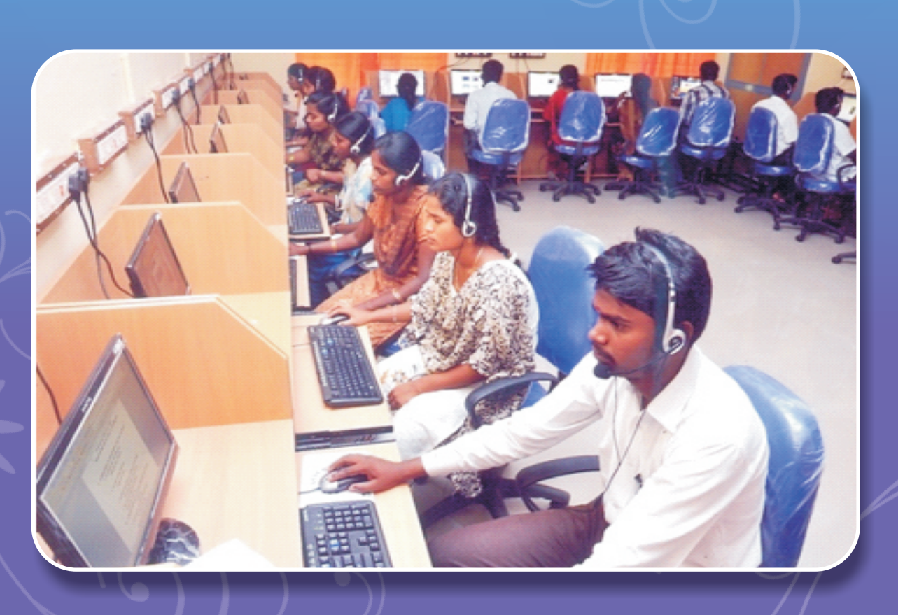
The students benefit by practising the skills in the Language Lab.