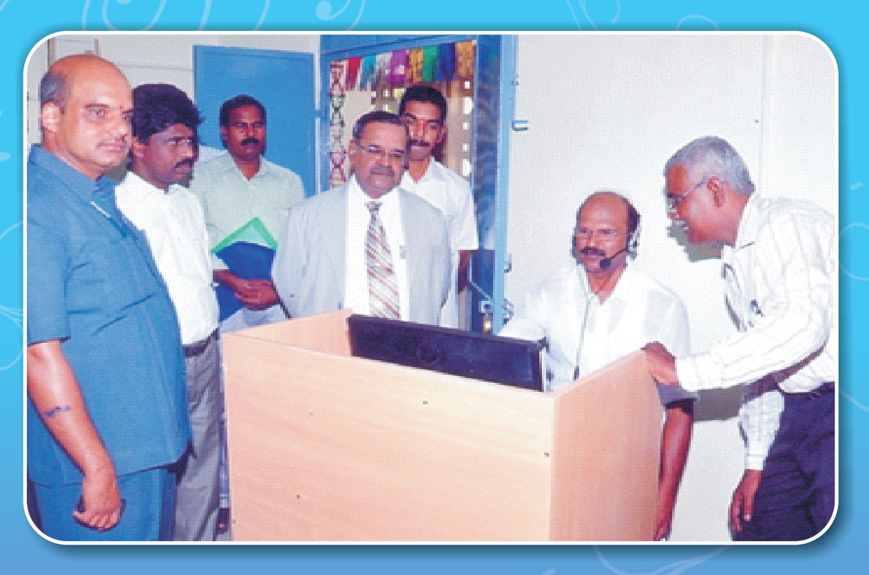
Honourable Minister sharing his jubilation in the Foreign Language Laboratory